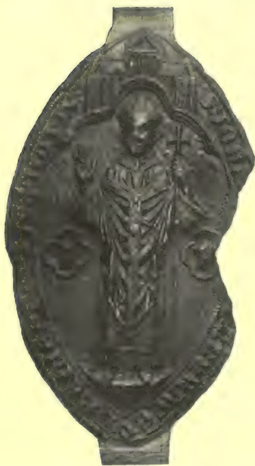
THE SEAL OF ARCHBISHOP JOHN LE ROMEYN.